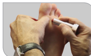
Delineate painful areas