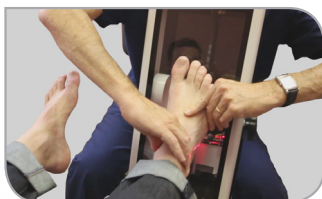
Non-weight bearing scanning

ScanCast 3D has all of the versatility that you need to perform a comprehensive examination and create an orthotic prescription.